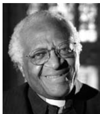
Desmond Tutu, Nobel Peace Prize laureate

Peace across the world begins with the peace that is nurtured in a home.